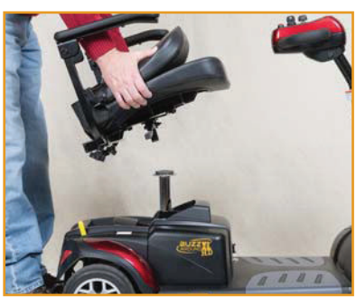
Step 1: Pop off the seat!