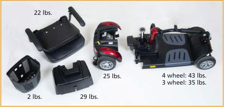
Disassembles into 5 pieces!