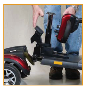
Step 4: Pull forward on the drivetrain release lever to separate the front and rear frame sections!