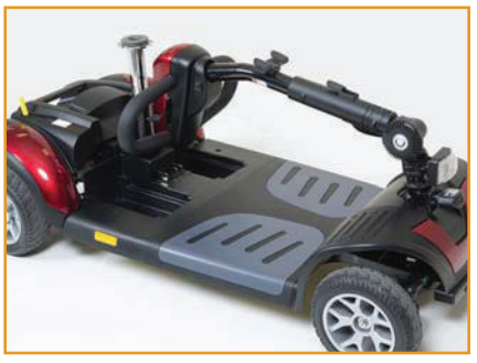
Step 3: Fold down tiller and lock in place!