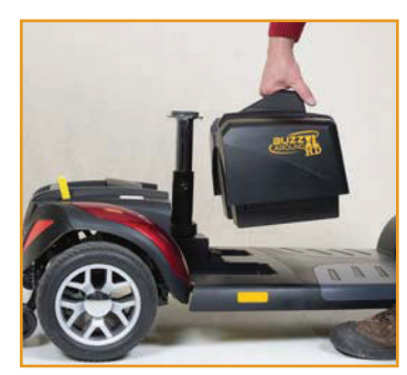
Step 2: Pull out the battery pack!