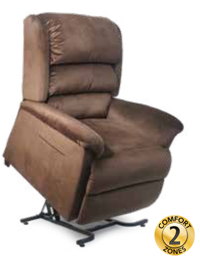
Relaxer PR766-LAR shown in Hazelnut

PR766-MED shown in Brisa<sup>®</sup> Coffee Bean*