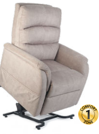
Elara PR118-MED* shown in Antler

The Eirene is mediumsized with a back style that provides maximum comfort in a tasteful button design. It features a supportive seating pad, an easy grip armrest design, and a USB port on the hand control for your phone or tablet.