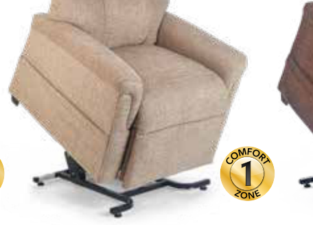
Comforter Medium PR531-MED shown in Sandstorm