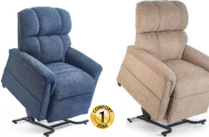
Comforter Petite/Small PR531-PSA shown in Oxford