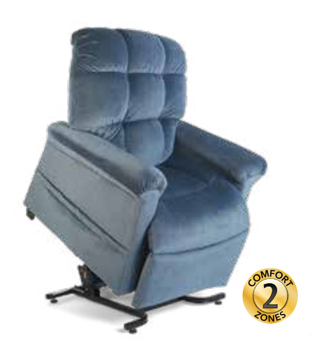
The Cloud<sup>™</sup> PR510-SME shown in Calypso

The Cloud<sup>™</sup> offers our unique, ergonomic Cloud seating system for long-term comfort and support. They feature our custom bucket seat, plush backrest, and solid molded high-density arm pillows for the ultimate in relaxation and rejuvenation.