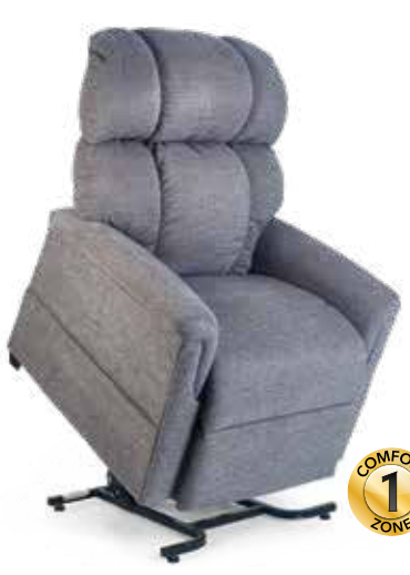
Comforter Tall PR531-TAL shown in Anchor