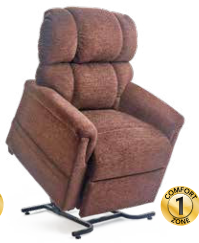
Comforter Large PR531-LAR shown in Bittersweet