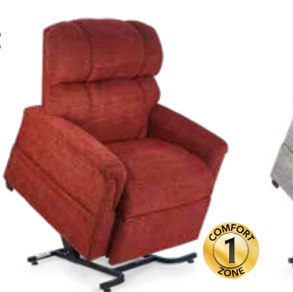
Comforter Wide Small PR531-S23 shown in Port

The Comforter Wide is perfect for those who need more space between the armrests. Constructed using the highest quality components for reliable, steady lifting and reclining, these chairs offer a weight capacity of up to 500 lbs.