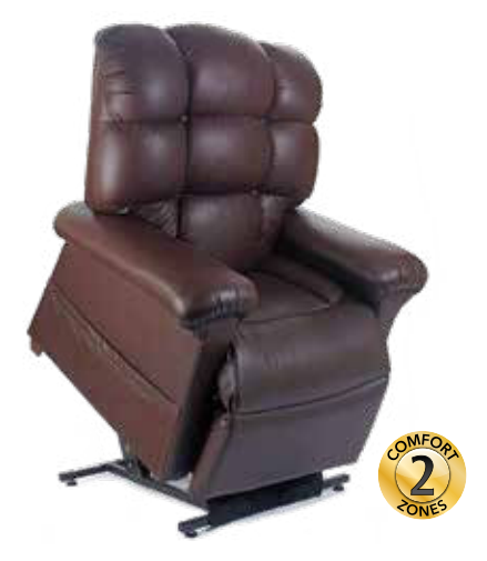
The Cloud<sup>™</sup> PR510-MLA shown in Brisa<sup>®</sup> Coffee Bean*

The Relaxer is the original MaxiComfort® power lift recliner. These chairs feature a luxurious three-pillow waterfall back with individual zippers for customizable comfort to relieve pressure and improve circulation. A full chaise pad provides lower body and leg support.