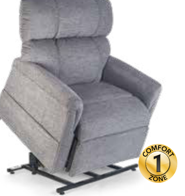
Comforter Wide Medium PR531-M26 shown in Anchor