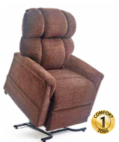
Comforter Wide Tall PR531-T28 shown in Bittersweet