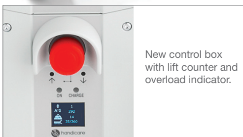
New control box with lift counter and overload indicator.