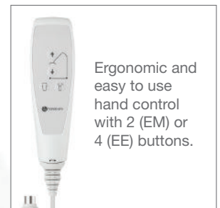
Ergonomic and easy to use hand control with 2 (EM) or 4 (EE) buttons.

The battery has high capacity and charging is needed less frequently. A sound signal can be heard when the battery level is low and an indicator on the control box shows when charging is in progress and when the battery is fully charged.