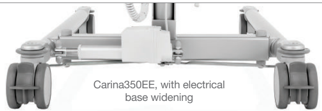
Carina350EE, with electrical base widening