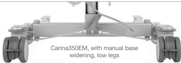
Carina350EM, with manual base widening, low legs