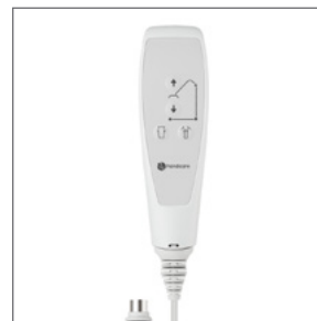
Ergonomic and easy to use hand control with 2 (EM) or 4 (EE) buttons.