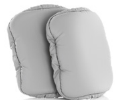
Padding for leg support