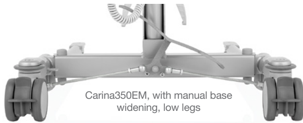
Carina350EM, with manual base widening, low legs