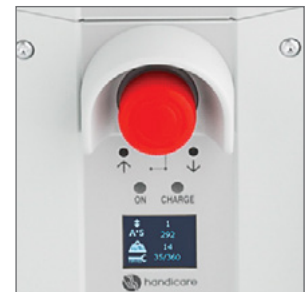
New control box with lift counter and overload indicator.