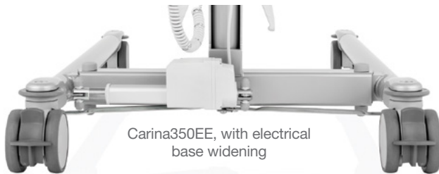
Carina350EE, with electrical base widening