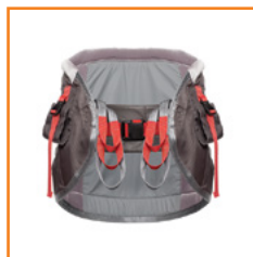
ThoraxSling With Seat Support, Polyester