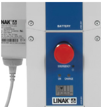
New control box with diagnostics, e.g. lift counter and overload indicator.