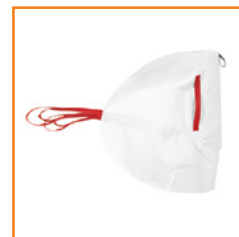
ThoraxSling With Seat Support, Disposable, Non-Woven