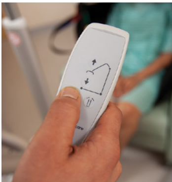
Ergonomic and easy-to-use hand control with 4 buttons.

Eva450EE is delivered with a standard carry bar length of 17 in (450 mm), which is suitable for most users and lifting situations.