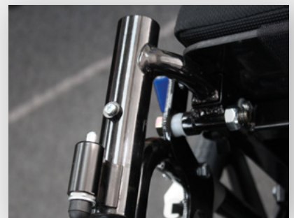
Offset Front Hangers (Optional)