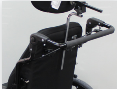
Standard Angle Adjustable Stroller Handles