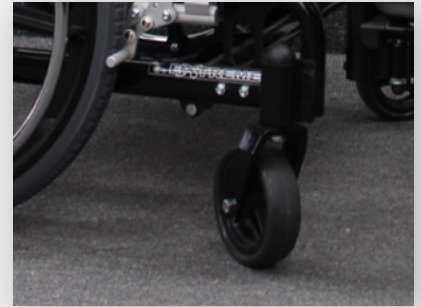
Angle Adjustable Front Journals