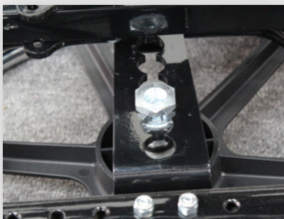
Seat To Floor Height Adjustability