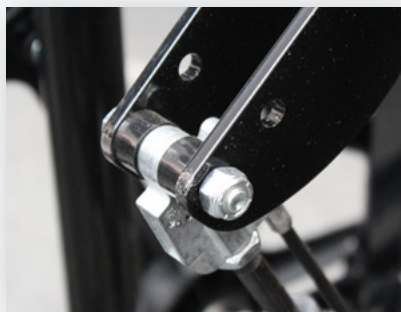
Zero Maintenance Soft Set Cylinders