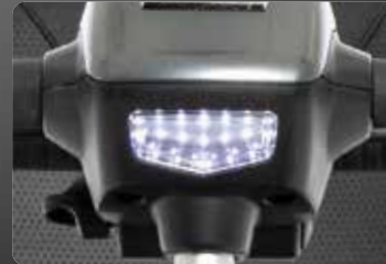
LED headlight in tiller

Experience the Revo® 2.0 , the most impressive mid-size scooter that combines an array of features into one great package. Tough and built to last, the Revo 2.0 offers rugged dependability you expect from luxury mid-size scooters. Comfort-Trac Suspension (CTS) ensures a smooth and comfortable ride over varied terrain. Experience convenient, feather-touch disassembly for portability that is comparable to our Travel Mobility line. Enjoy standard under seat storage and speeds up to 5 mph.