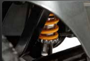
Pride's CTS Suspension

Exclusive stylish, lightweight, non-scutting, black, low-profile tires (Optional pneumatic tire on the 4W: S67)