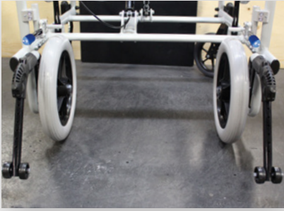
Narrow Configuration (Inside Wheel Mount)