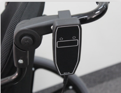
Power Tilt Option