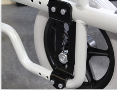
Rear Axle Adjustability