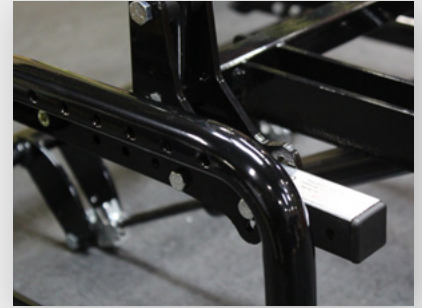
Rear Depth Adjustable Frame