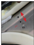
BACK PIN POSITIONS ADJUSTABLE HOLES

Accommodates Pelvic rotation and will allow for full back support with 25 degrees of posterior and 20 degrees of anterior adjustability.