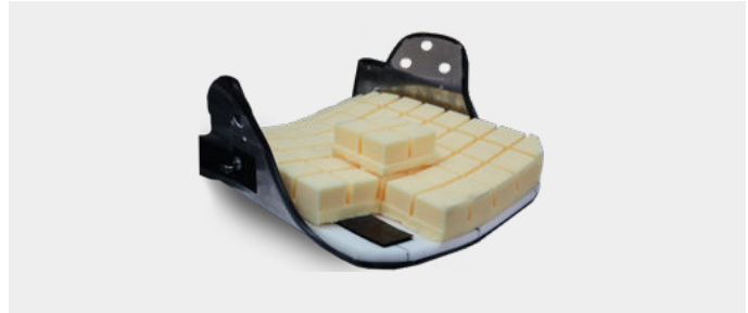
Inner Foam and Incontinent Cover